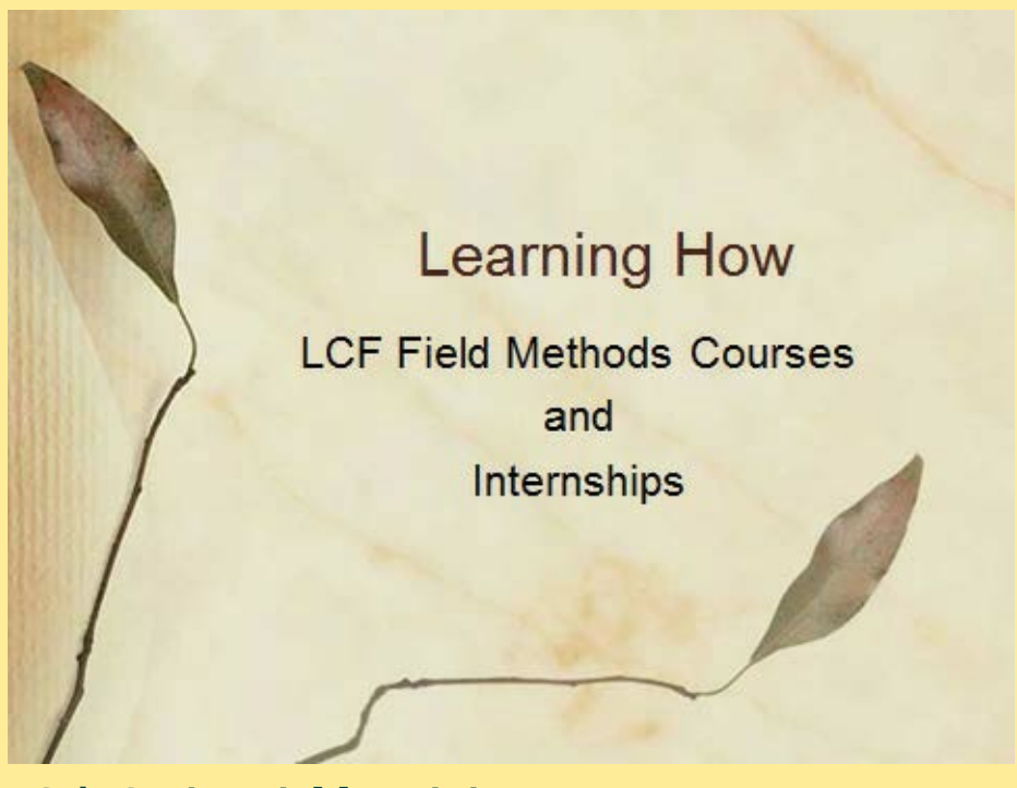
LCF's Spring Field Training Programs