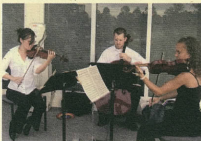
The musicians provided an elegant ambience