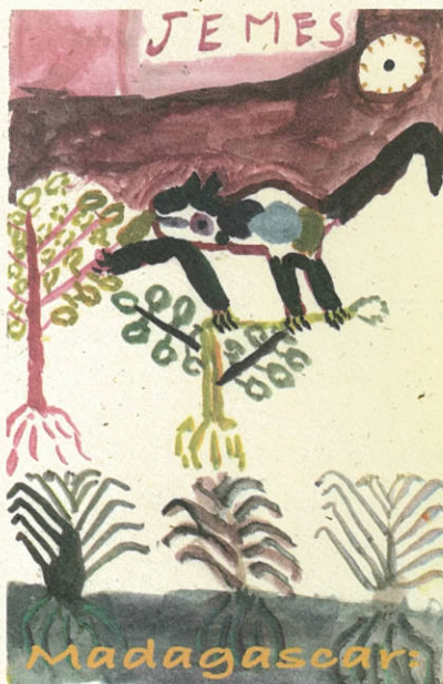
Madagascar: a village paints it's world april 14, 2006 through june 2006