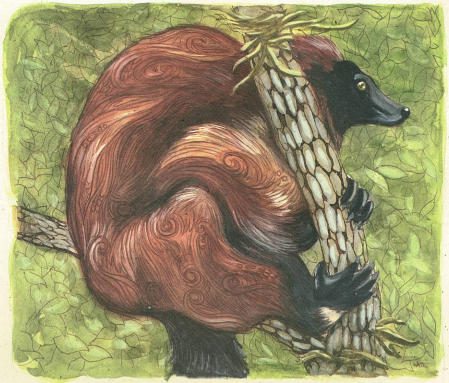
Sara Watts award winning painting of a red ruffed lemur

fragile circumstances of Madagascar's forests and people. Selby shares a conservation imperative with LCF and we are delighted to have partnered with them for Madagascar: A Village Paints Its World.