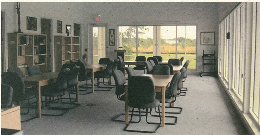
The Center's conference and reading room