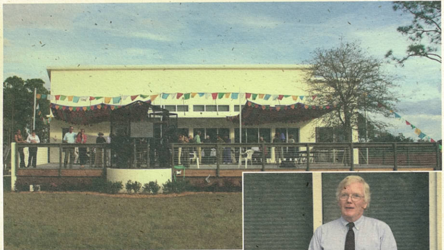
The Mianatra Center decked out for the festive occasion