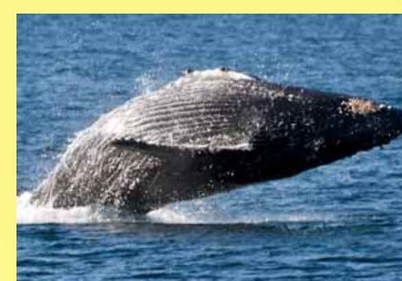
Megaptera novaeangliae Trozona Humpback Whale