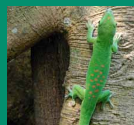
Phelsuma madagascariensis grandidieri Katsaraka Madagascar giant day gecko