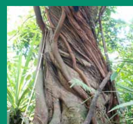
Ficus vitiensis Fizany Council tree/Strangler Fig