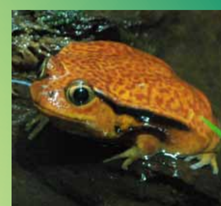
Dyscophus antongilii Radaka Tomato Frog