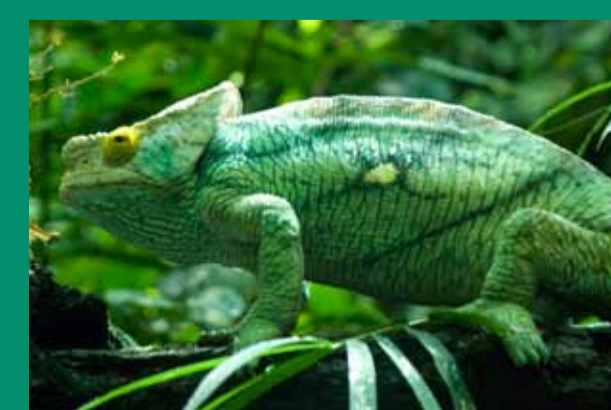
Parsonia parsoni Tambony Common Chameleon