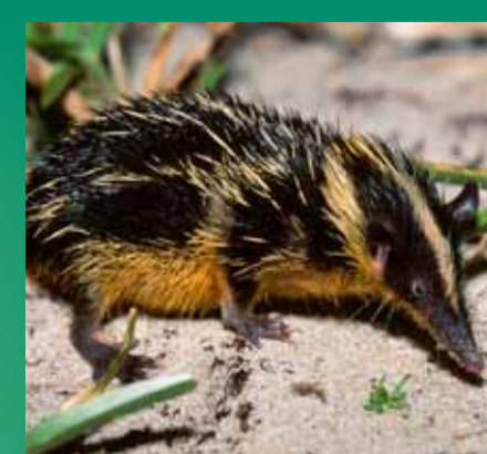
Hemicentetes semispinosus Sora Lowland Streaked Tenrec