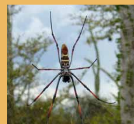
Nephila madagascariensis Hala Golden silk orb-weaver