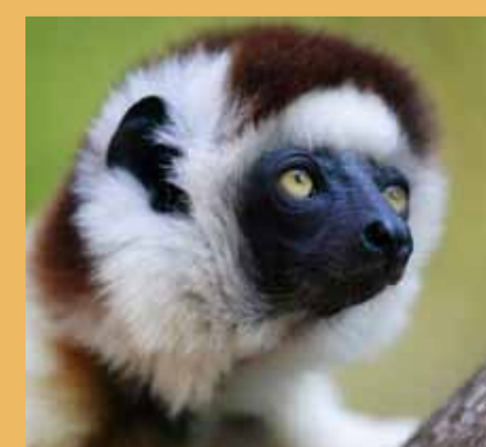
Propithecus verreauxi Sifaka Verreaux's sifaka