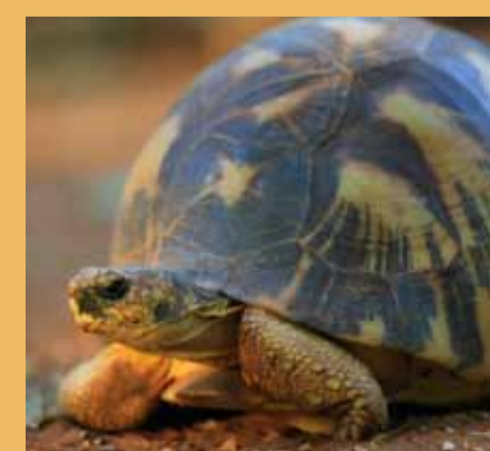
Geochelone radiata Sokake Madagascar Radiated Tortoise