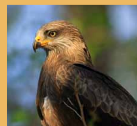
Milvus migrans Papango Black kite