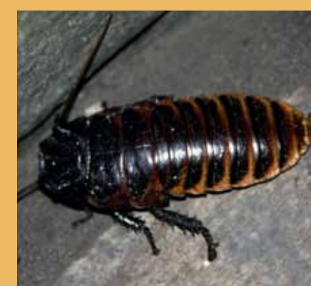
Gromphadorhina portentosa Kadradraka Madagascar Hissing Cockroach