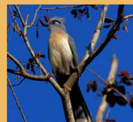
Coua cristata Alihotsy Crested coua