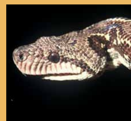
Sanzinia madagascariensis Dô Madagascar tree boa

Maky lahy manosotra fofona ny rambony hiatrika adim-pofona. Male ringtails stink-fight by scent-marking their tails.