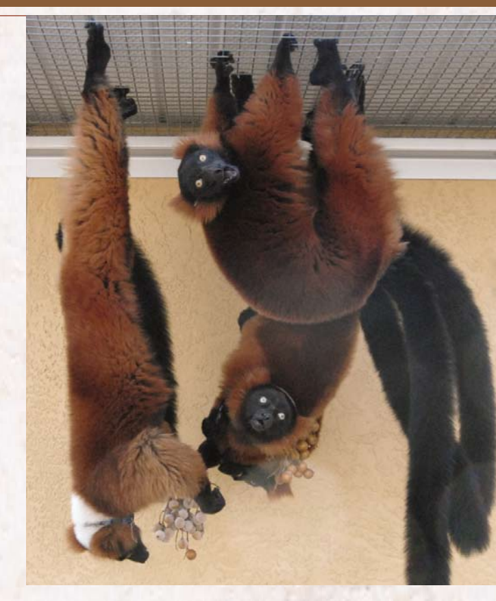
Valona Bladstrom, Kintana North, and Orana Wood, juvenile red ruffed lemurs "hanging out" and enjoying tropical fruit called longans.

Sarasota Whole Foods — Generous contribution of "expired" fruits and vegetables, vastly enriching the