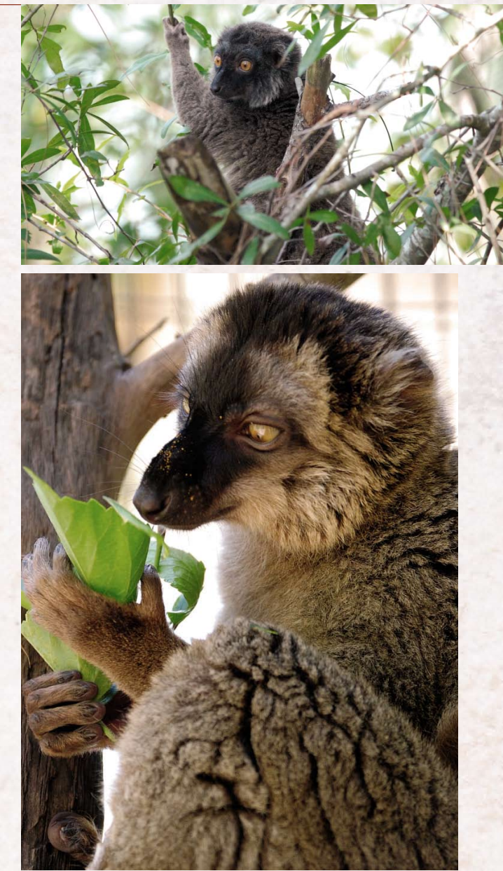
TOP: Bao, female Sandford's brown lemur; BOTTOM: Malbec, male common brown lemur