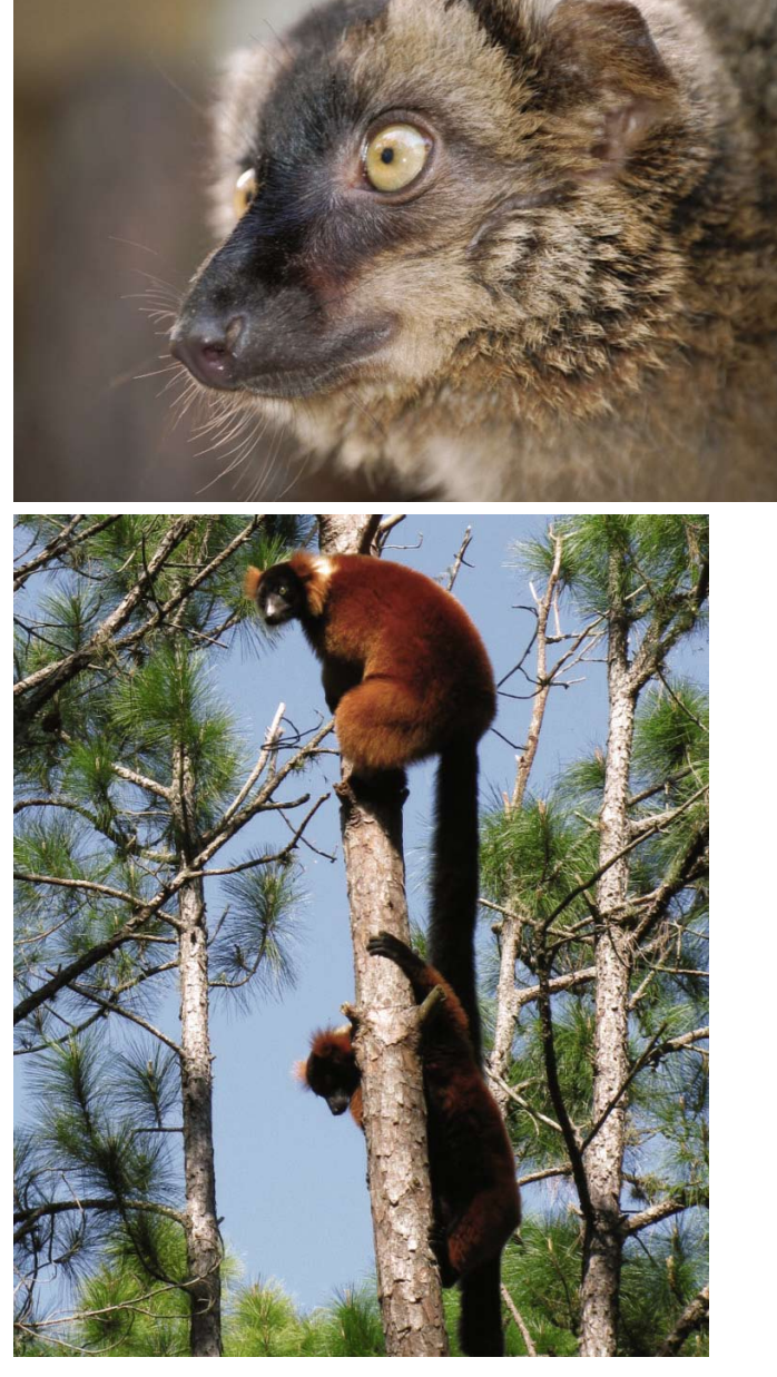
TOP: Malbec, male common brown lemur, Photo Tyann Marsh BOTTOM: Kintana and Orana, juvenile red ruffed lemurs, discovering the forest, Photo Monica Mogilewsky