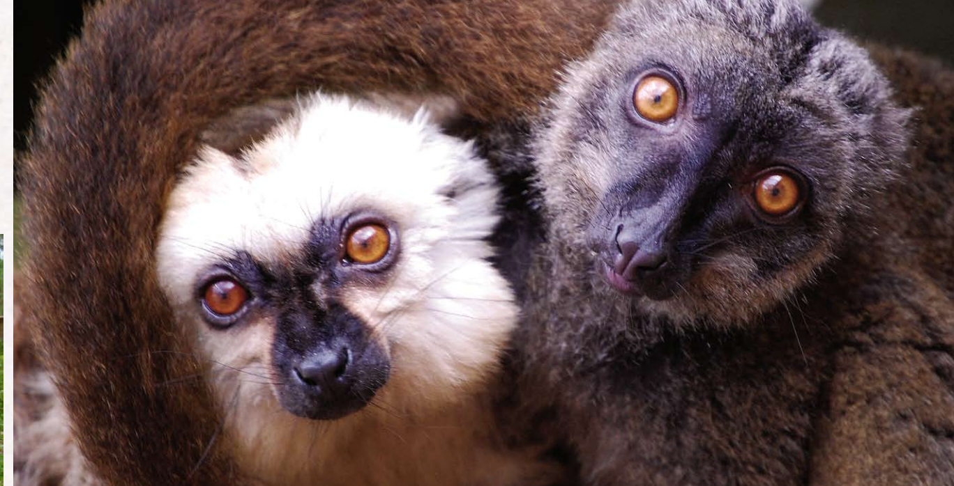
LEFT: Participants in the Teachers Institute for Conservation Biology RIGHT: Fred and Gideon, two male white-fronted brown lemurs

LCF intends to launch the Tontolo Lainana Mitsangatsangana (Mobile Natural History Show) in Madagascar with our partners, ESSA-Forêts. The program will utilize a mobile unit outfitted with audio-visual equipment to conduct education outreach in rural villages in northeastern Madagascar and to present entertaining and informational environmental films about the natural history of Madagascar. In addition to their presentations, the project team – two naturalist/drivers and one charismatic teacher who will be supervised and supported by Malagasy investigators - will dialogue with villagers to ascertain learn what they need to help them preserve it for their own future.