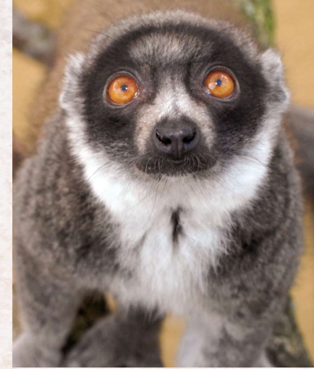
TOP: Emilia, female mongoose lemur, enjoying a hibiscus flower; BOTTOM: Estella, female mongoose lemur