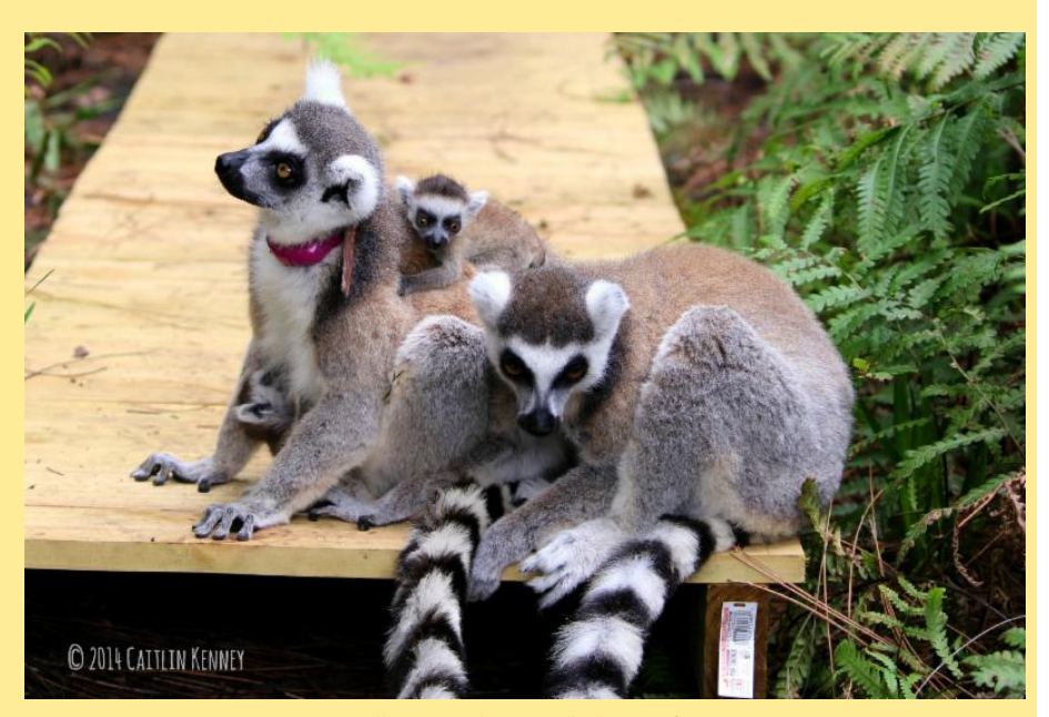
Ansell, Yuengling and their infants.

When you shop on Amazon start with SMILE! Amazon will donate 0.5% of your purchases to LCF. CLICK HERE to learn more.