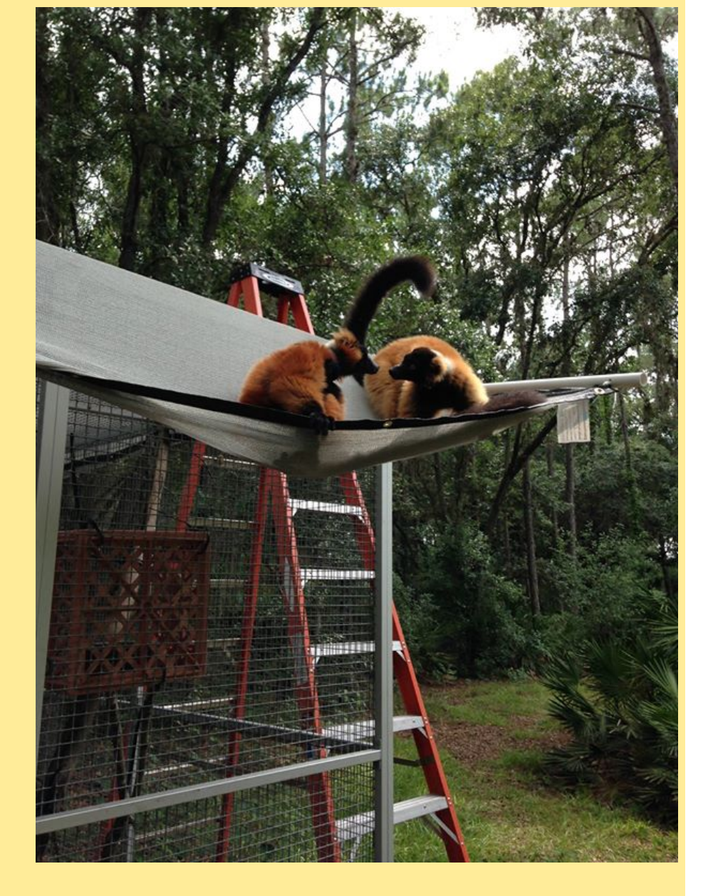
Red ruffed boys demonstrate uses for a shade cloth recently installed at our forest domes!