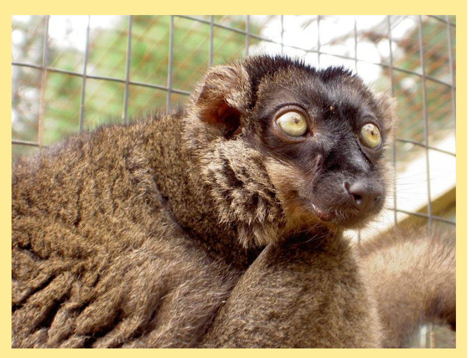
Meet Pinot, a common brown lemur, or Eulemur fulvus