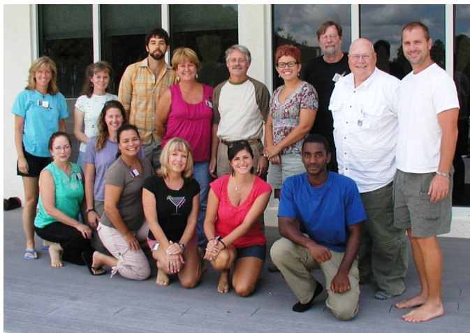
Class of 2009 with their instructors