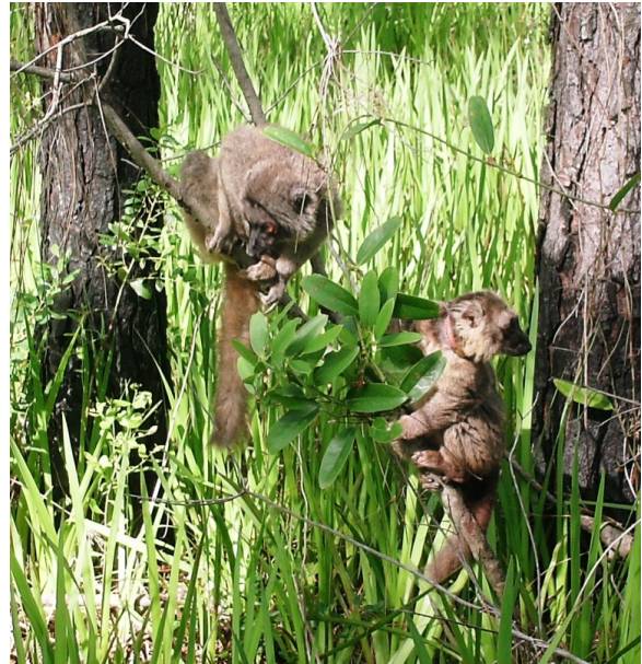
Eulemur sanfordi patrolling their habitat