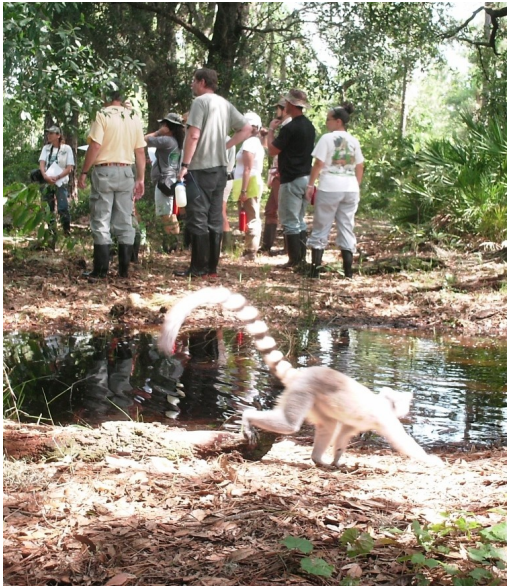
Subject observing class in the field

This year's Teachers Institute for Conservation Ecology, funded by TogetherGreen, an alliance between Audubon and Toyota, was the best Institute yet! The bright, curious and enthusiastic teachers came mainly from the east coast but from as far away as Maine. They represented both private and public schools.