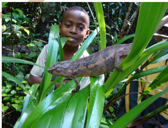
Malagash boy meets local fauna

The Lemur Conservation Foundation has been named a recipient of