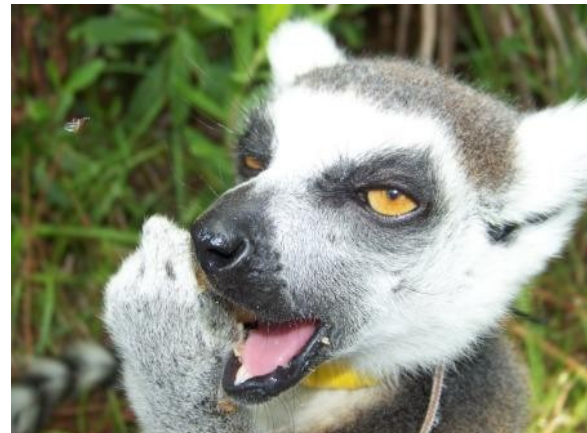
Lemur catta enjoying his meal.

The Lemur Conservation Foundation (LCF), Incorporated in Florida (1996), is a 501(c)(3) not-for-profit publicly supported organization (EIN 59-3359549) dedicated to the preservation and conservation of the primates of Madagascar through captive breeding, non-invasive scientific research, education, and reintroduction. LCF is certified by the Association of Zoos & Aquariums.