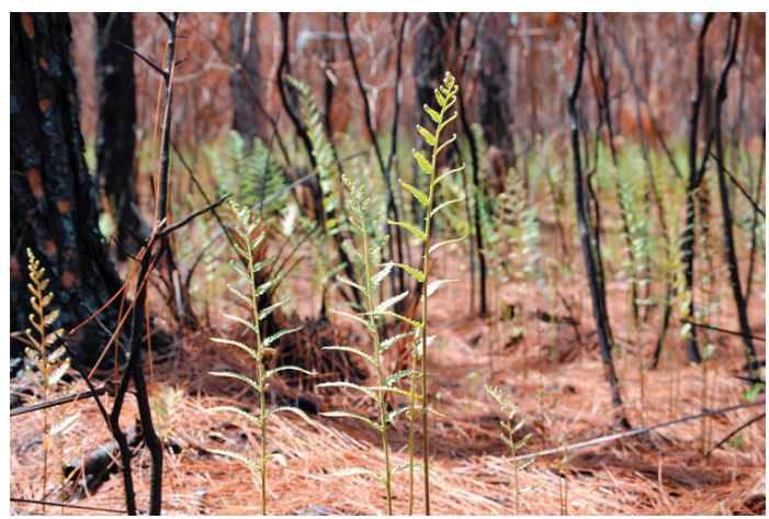
Regrowth one week after the burn

The following day, we received a good amount of rain that helped to put out still smoldering trees and stumps. Though prescribed burns are a lot of work, they are greatly beneficial, and this latest burn was a complete success.