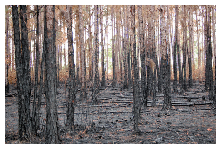
Forest the day after

their enclosures for the duration of the burn. Around 10am, Mike and Forest Rangers Chris Taylor and Eugene Clark ignited the fire in the Northwest corner of the enclosure. For several hours the fire worked its way against the wind to the Southeast, burning through the underbrush of Toomey Woods. LCF staff, Myakka Fire Department firefighters and Forest Rangers kept watch on the fence-line for any flare-ups or line-jumps by the fire. By late afternoon, the fire had reached the Southeast corner of the enclosure, and brush trucks full of water were brought in to put out the fire as it approached the fence-line.