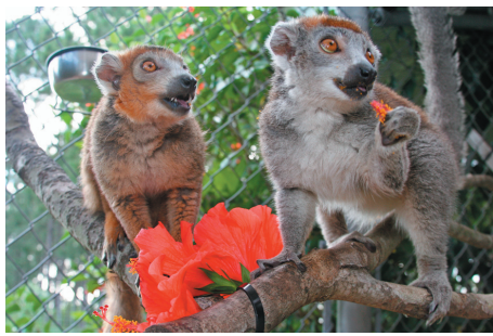
Azizi and Rollo munching hibiscis

It is hoped that at least one or two of the Eulemur species