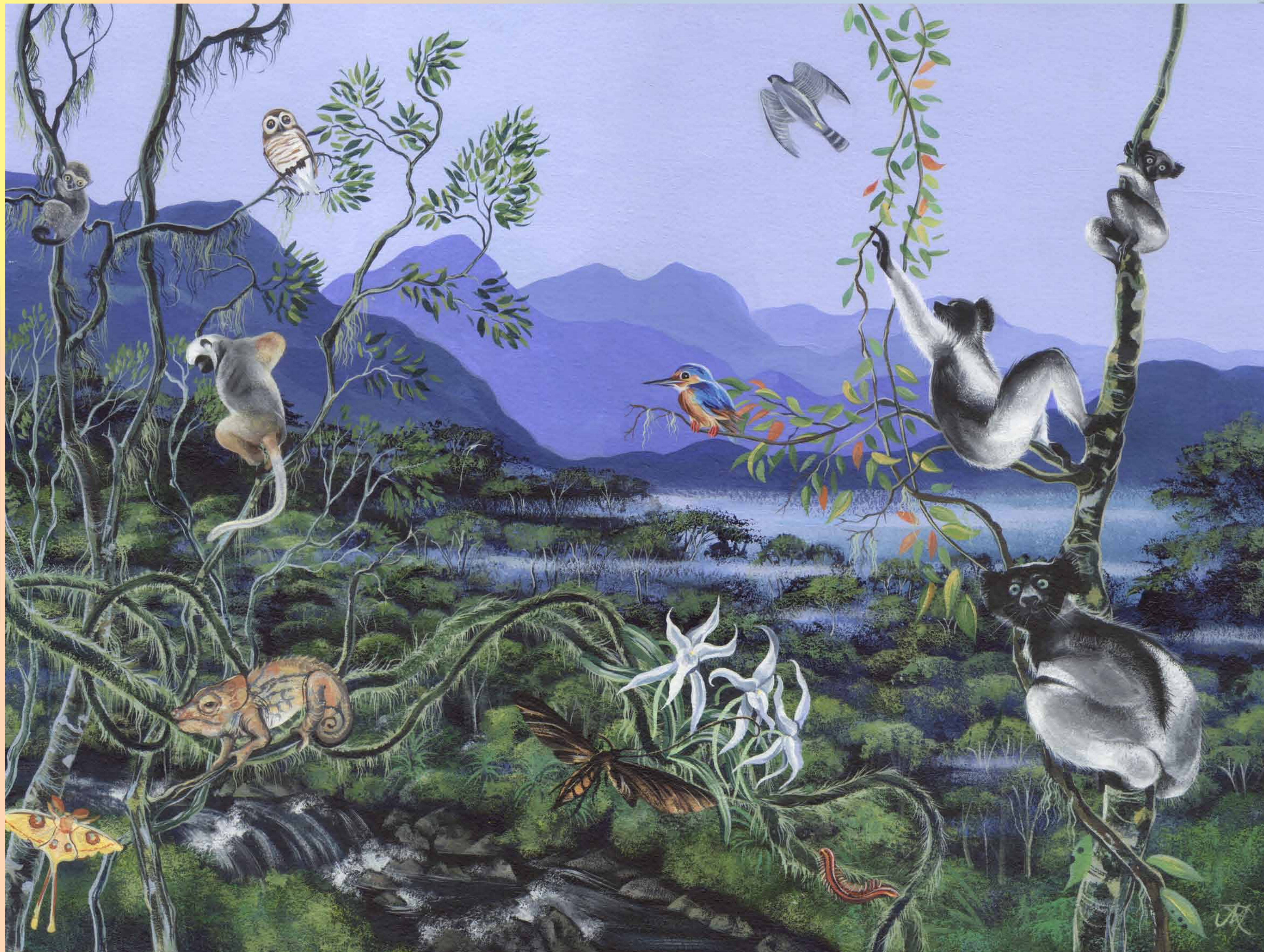
Mifandrohy ny zava-manan'aina rehetra ao anaty ala