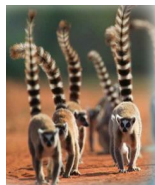
Maky Ring-tailed lemur Lemur catta

Mita 4 hatramin'ny 30 ny biby anaty andiany maky iray. Ny vavy no mifidy voalohany ny sakafy sy ny tserana ary ny lahy tiany hiraizana, fa mandefitra ny lahy.