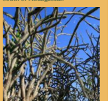
Sonimbarike Cactus tree Didierea trollii

Ny 95 isan-jatan'ny zava-manitra ao anatin'ny alan-tsilo dia any atsimon'i Madagasikara ihany no misy any. In the spiny forest 95% of the plant species are unique to the south of Madagascar.