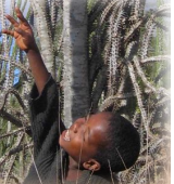
Ny alan-tsilo Spiny Forest

Ny 95 isan-jatan'ny zava-manitra ao anatin'ny alan-tsilo dia any atsimon'i Madagasikara ihany no misy any. In the spiny forest 95% of the plant species are unique to the south of Madagascar.